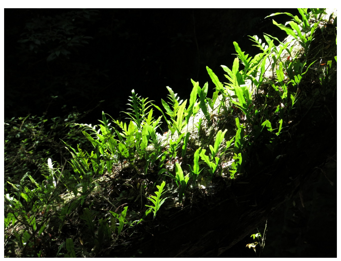
Microsorum pustulatum / hound's tongue fern

Commence life on the host plants trunk or branches, have creeping rhizomes that attach to the host plant's bark. Examples are Pyrrosia elegnifolia and Mircosorum pustulatum .