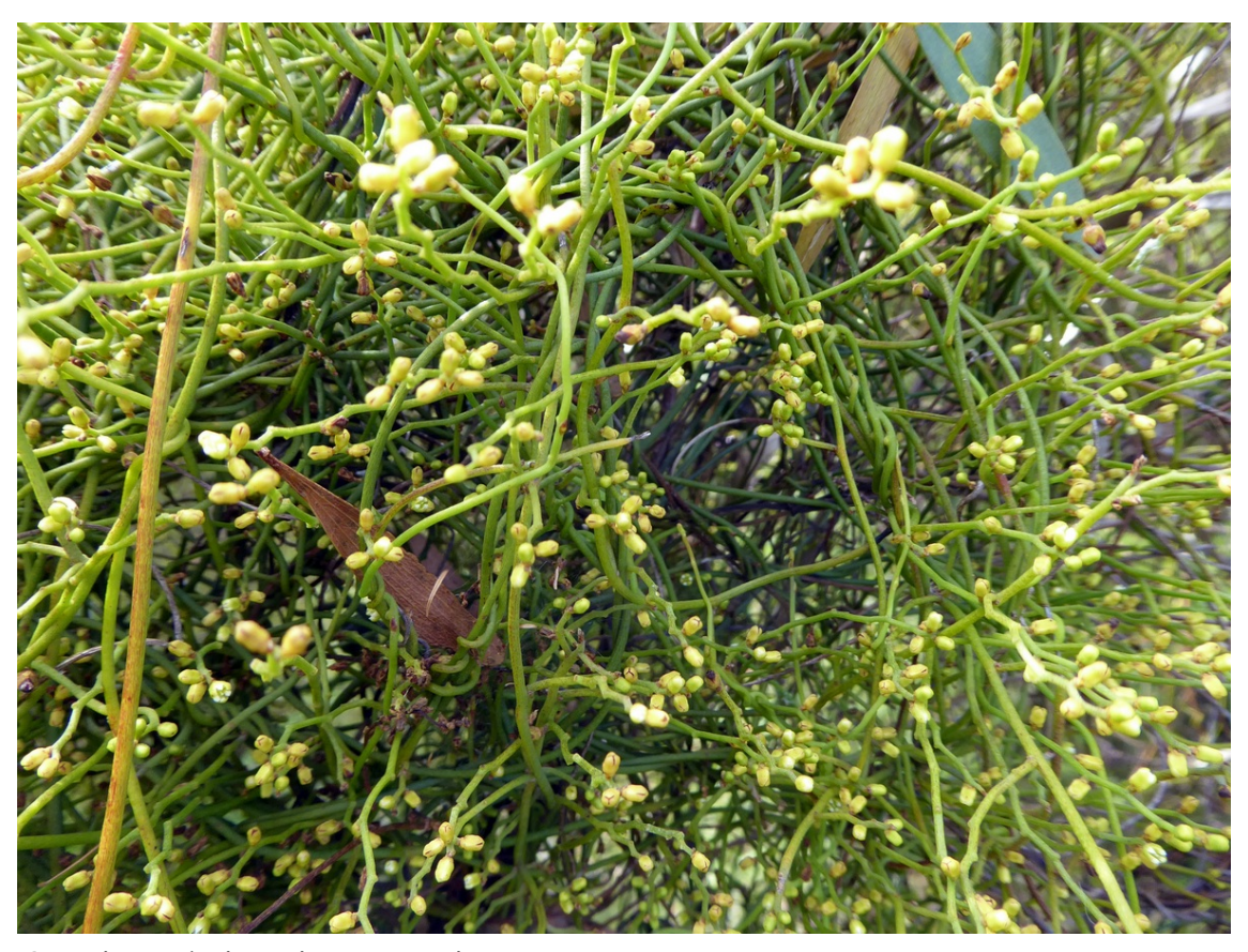
Cassytha paniculata (photo: Peter de Lange)

While there are a number of native plants that could be termed strange or unusual, e.g Dactylanthus taylori (woodrose) and Ripogonum scandens (supplejack), Cassytha paniculata is quite unique in that it has no roots and no leaves! Along with its close relative Cassytha pubescens they are the only parasitic vines to be found in New Zealand.