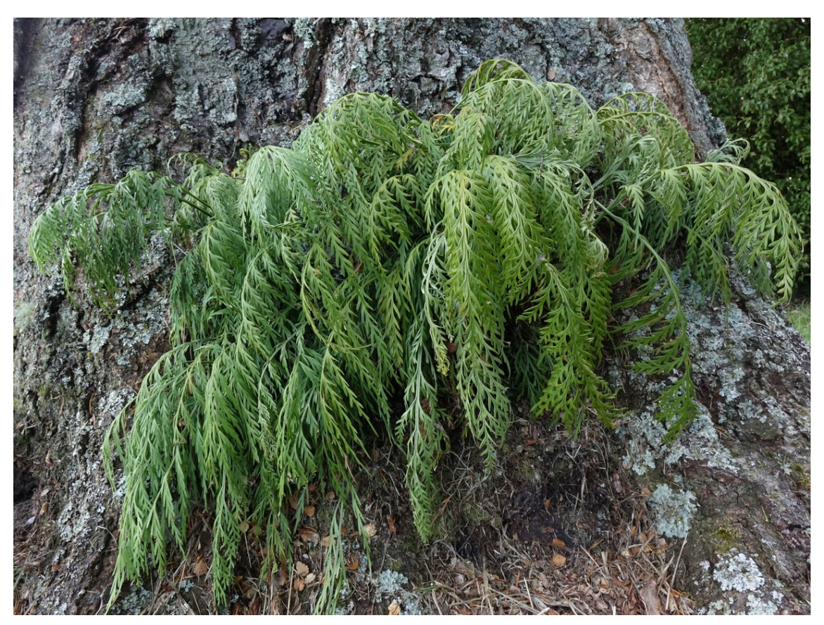
Asplenium flaccidum

Of the forty-six species of pendant ferns, fifty-two percent are endemic to New Zealand and forty-eight percent occur in other countries, the majority being located in Australia. Fortunately, the majority of New Zealand's epiphytic ferns are not threatened with only five species being classified as a 'at risk'. Hymenophyllums (filmy ferns) with over twenty species are the predominant epiphytic ferns in New Zealand.