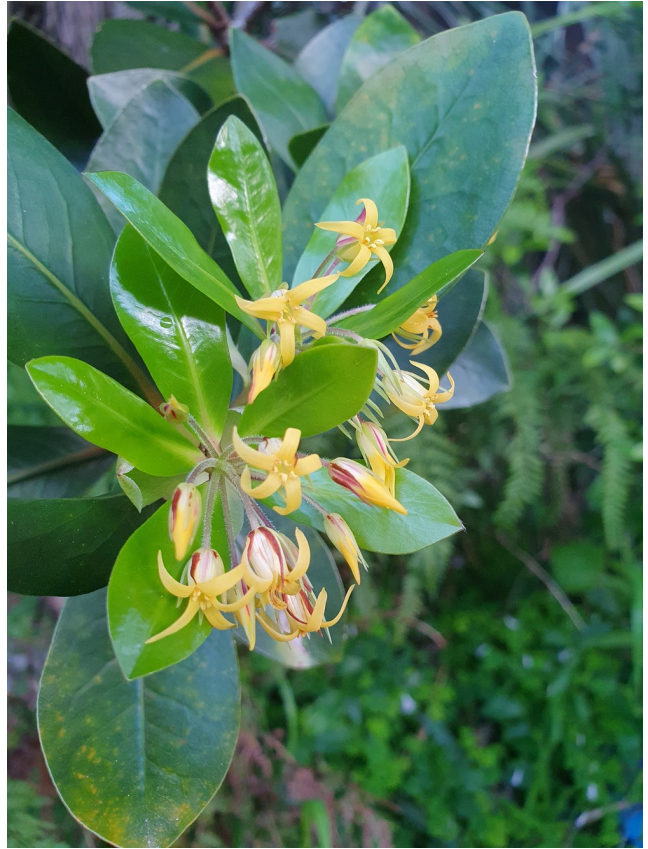
Pittosporum cornifolium (Hauraki Gulf variety)