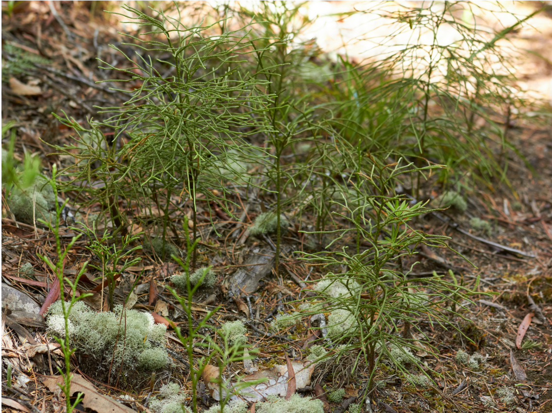
Small "forest" of Lycopodium deuterodensum

A very distinct club moss that forms a dense colony of tangled conifer-like growth. Found throughout the North Island from Lake Taupo north. Thriving in forest margins and scrubland.