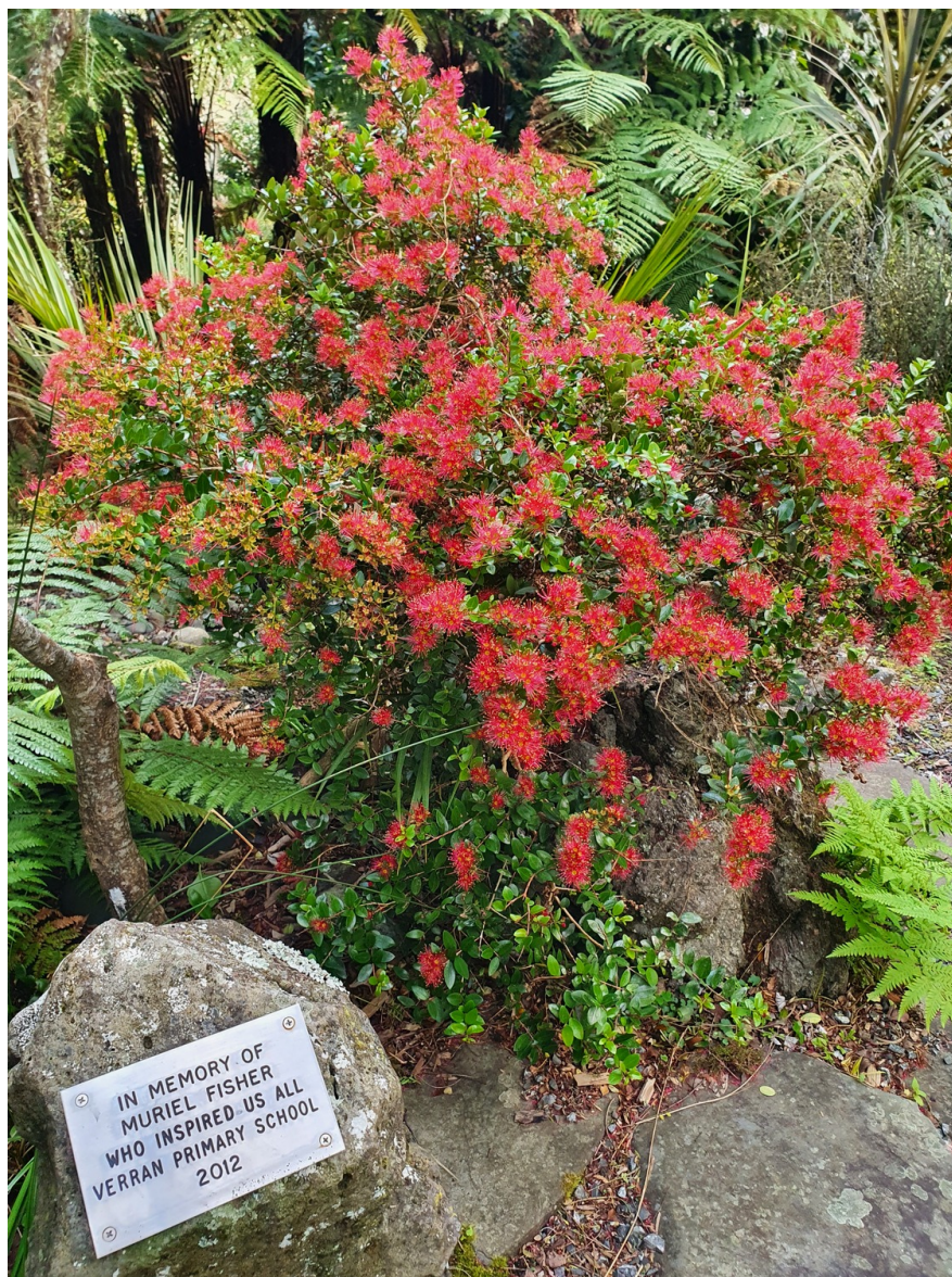
Metrosideros carminea (Carmine rata)