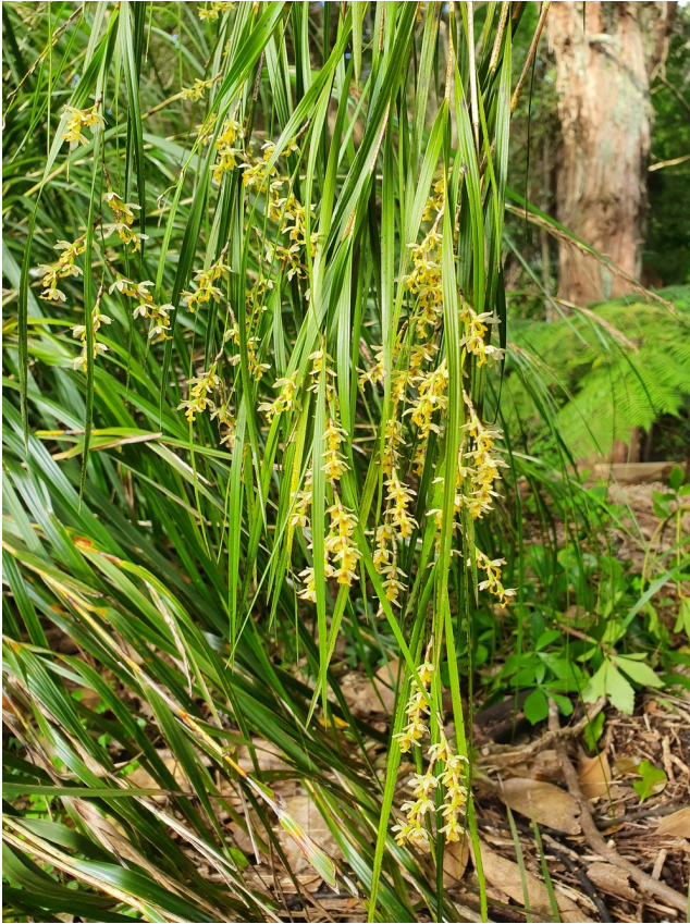
Earina mucronata (bamboo orchid)