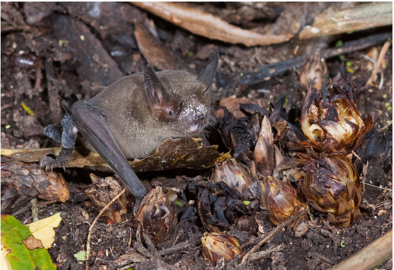
Dactylanthus taylorii with pekapeka / short-tailed bat