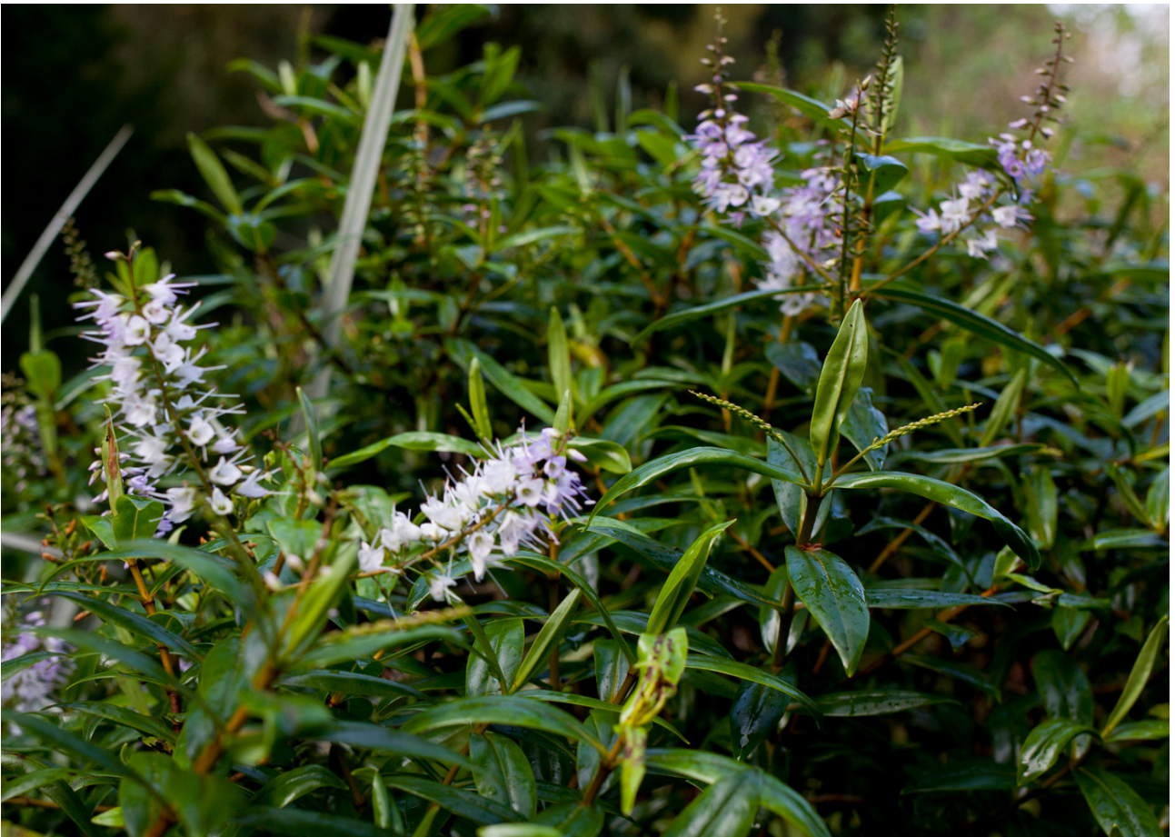
Hebe Veronica bishopiana