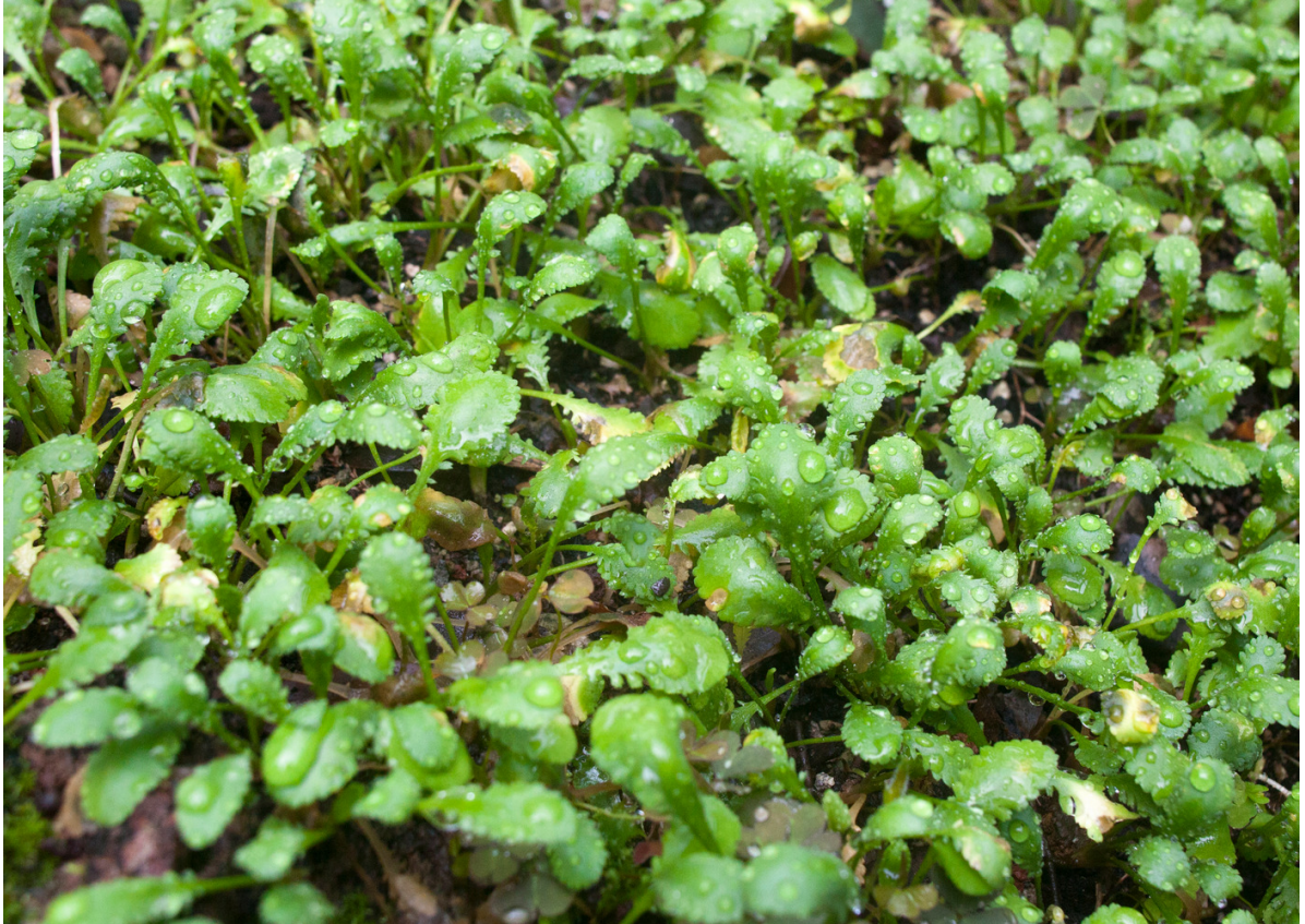
Leptinella rotundata at Fernglen