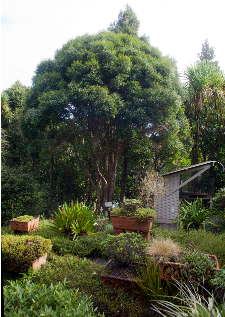
Metrosideros bartlettii at Fernglen

On a recent visit to the Wairarapa, while perusing an excellent Saturday market in Greytown, I discovered a large stand of young Metrosideros bartlettii plants. This was probably the last place in New Zealand I would have expected to find specimens of this rare plant. What was even more intriguing, they appeared to be grown from seed because of the multi-branched habit. I enquired about the origin of the plants. I was informed that the plants had been purchased as very small tube lines and grown to a saleable size. The woman selling them was well aware of the rare nature of the plant but was astonished when I informed her of the dimensions of our Metrosideros bartlettii at Fernglen. This was an excellent reminder that you never know what you will find at a local market!