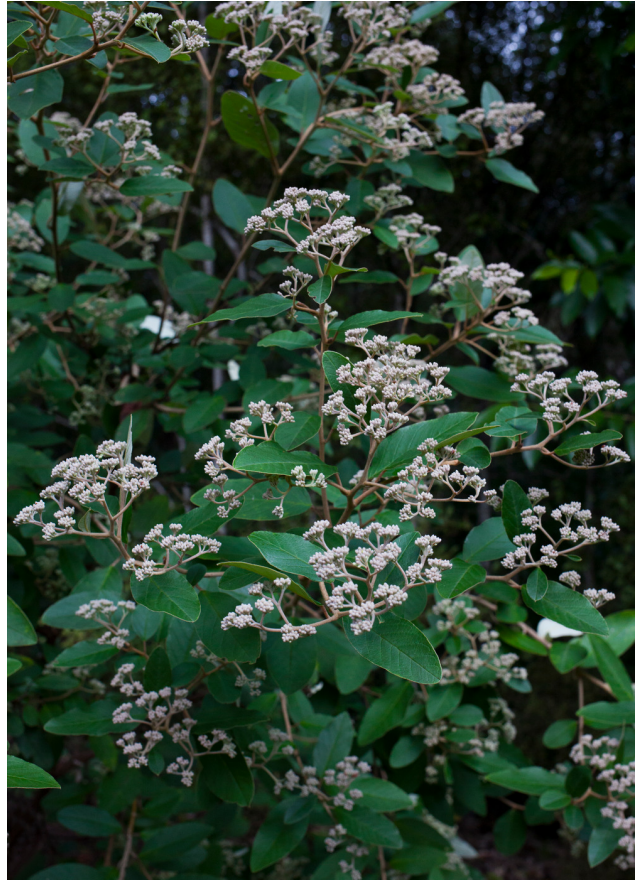
Kumarahou pomaderris, kumeraho