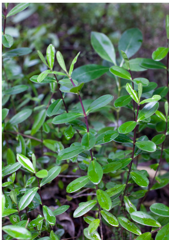
Hebe obtusata at Fernglen