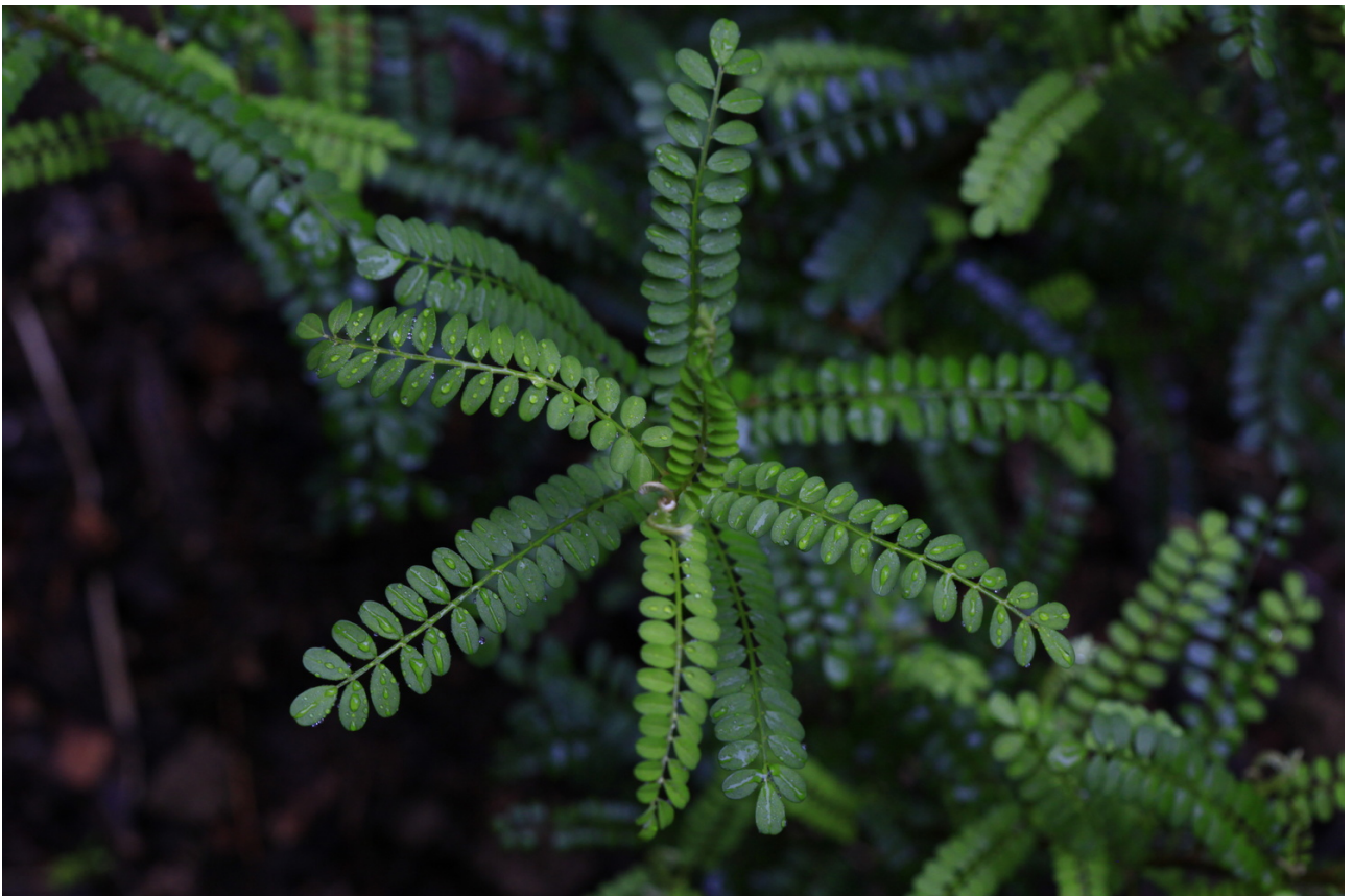
Sophora mollyii up close