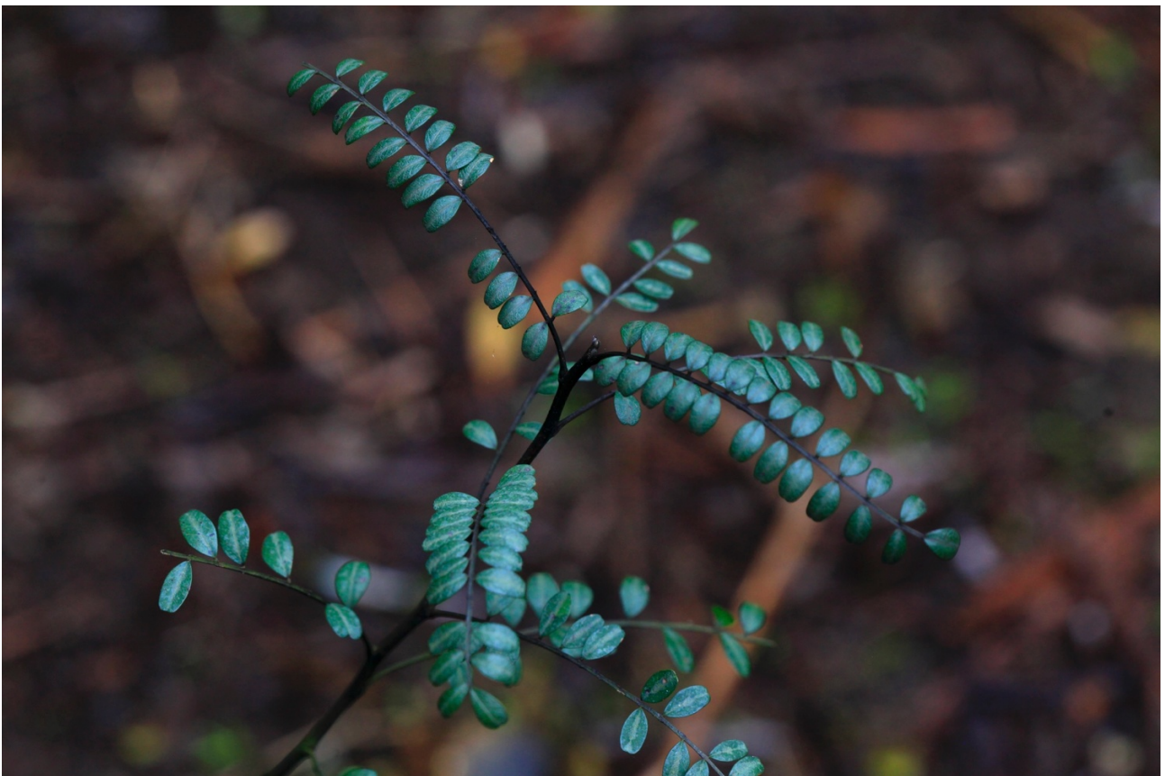
Large leaved kōwhai Sophora tetraptera