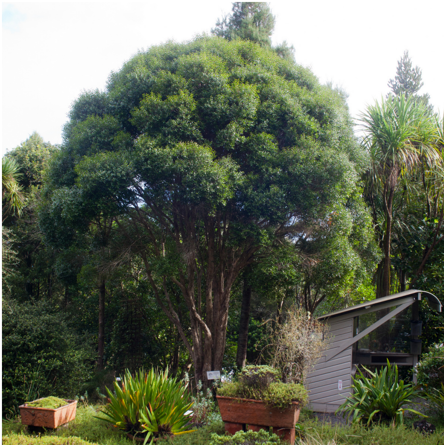
Metrosideros bartlettii at Fernglen